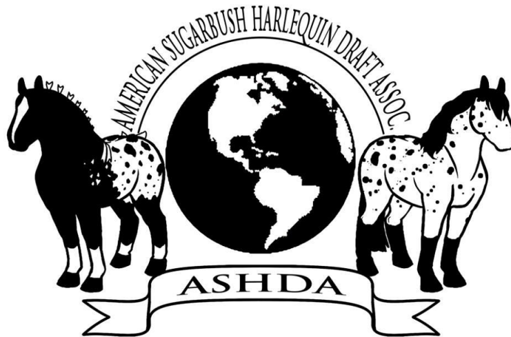
ASHDA Official Logo