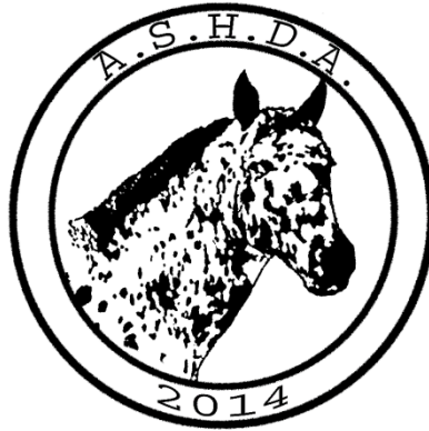
ASHDA Official Seal

The ASHDA Seal shall have inscribed thereon the name of ASHDA and the year of organization. The Seal may be used by causing it or a facsimile thereof to be impressed or affixed or in any manner to be reproduced. No individual or unauthorized entity may use the official ASHDA seal or Logo without written permission from the Executive Director. This excludes official ASHDA merchandise sold through the Association.